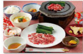
Horse meat dinner meal "Sakura-zen" ¥1,910