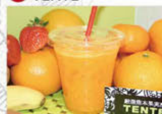
Fresh fruit juice ¥300~