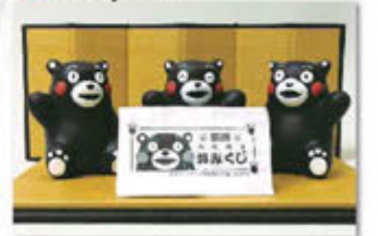
"Kumamon" Fortune-teller ¥378