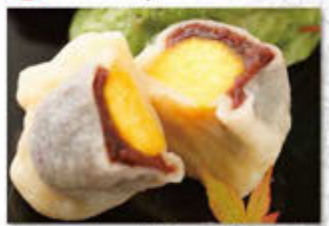
Annou-imo "Ikinari-dango" Sweet potato dumpling with sweet beans ¥200