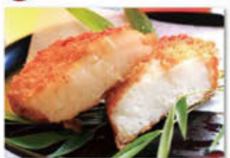
Deep fried fish cake "Oranda-age" ¥215