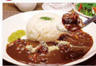
Hashed beef rice * Open till 6:00pm ¥900