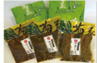
"Aso takana" Pickled vegetable from Aso area, and mt. Aso Favorites.