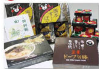
Variety of souvenirs such as ramen, cakes, cookies and local favorites