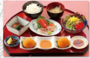
Sea urchin croquette meal ¥1,944