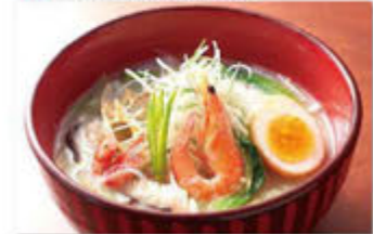
Rice noodle meal "Thai-pi-en" ¥880

Wakuwaku-za (history and culture experience center)