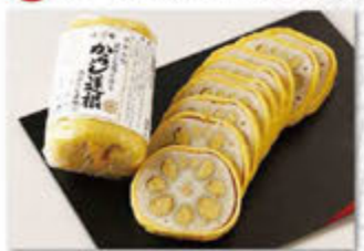
Fried lotus roots stuffed with Japanese mustard "Karashi-Renkon" ¥1,080