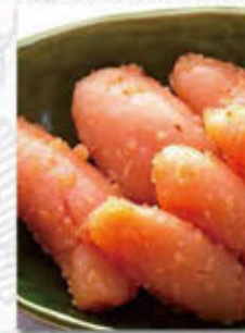
Marinated roe of cod fish with sake