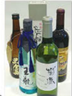
Various wine, distilled liquor and limited sake from Kumamoto area. Also offering local snacks