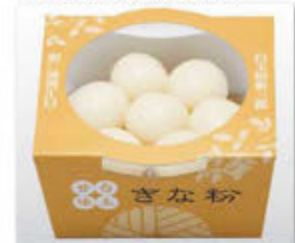
Sweet rice dumpling "Shiratama-amami" ¥367