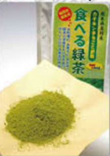
Edible green tea (100g) ¥864