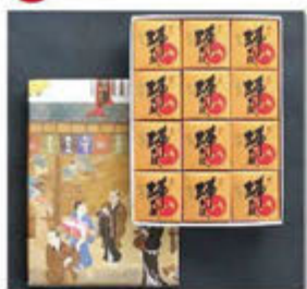
Cake named "Homareno-Jindaiko" ¥713~¥4,126