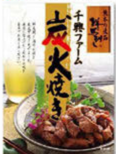
Grilled horse meat (100g) ¥600