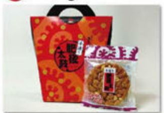
Sweet nuts cracker "Higodaiko" 4 pieces ¥518